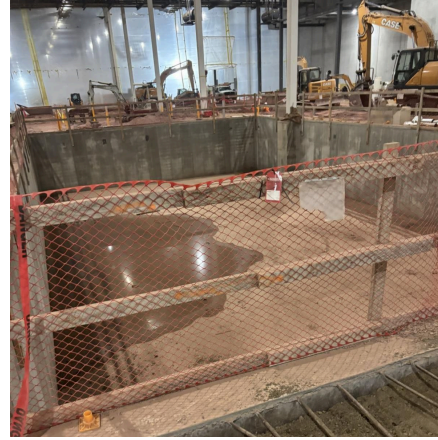
Pictured: Freezer Room is on the left with three ready mix trucks inside. The Fryer Pit is on the right.