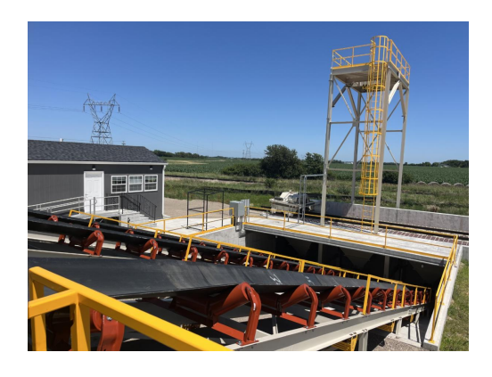
Harrisburg Terminal's Unload Pit

The other project was the creation of the Central Lab. In 2024, we decided to make the strategic decision to move our asphalt lab from the location on Rice Street to the "old Haber building" behind the Ace Harrisburg plant so that we could support both the new NMP asphalt plant and Rice Street plant. Moving the lab allowed us to expand and support other QC efforts such as concrete testing and breaks and aggregate testing from other locations. The team put in a lot of effort to clean up the location and make it a great place to support various QC efforts. We have since renamed the building the L. G. Everist Support Center. The building is home to the Central Lab, the electrical division, and our newest maintenance division; all are support services for L. G. Everist, Myrl & Roy's, Ace Ready Mix, and D & I. This vision highlights how with the right people and right space we can support multiple plants and functions of the companies.