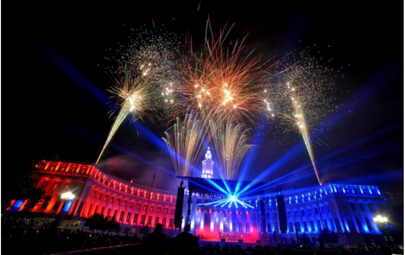
Fireworks over Denver's City and County Building