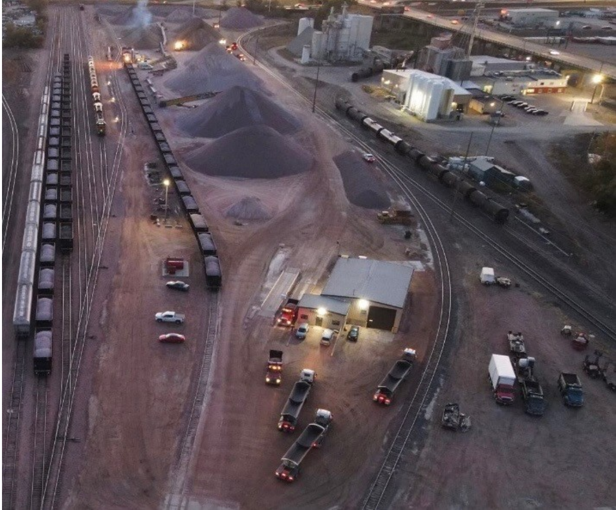
Aerial view of Track 6 in Sioux City, IA.