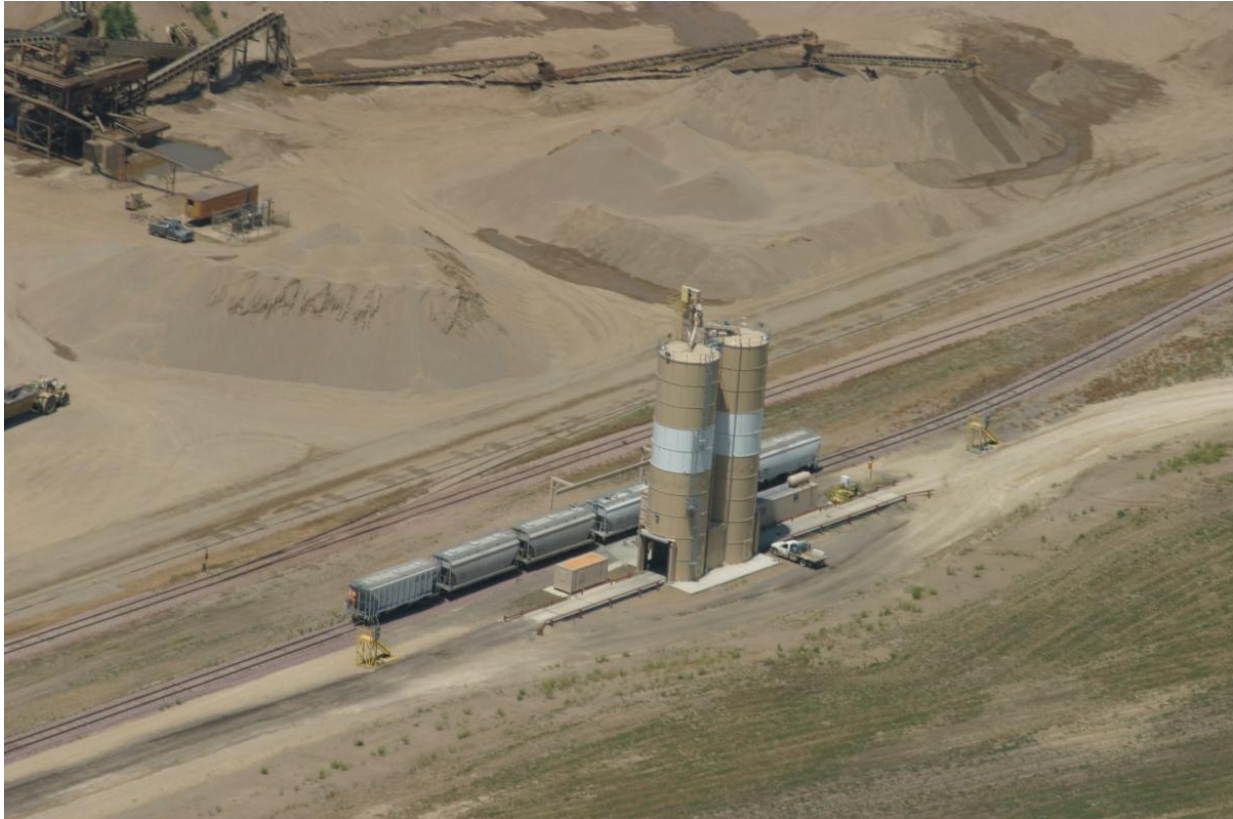
Aerial view of the cement terminal in Hawarden, IA.

With reflection and attention to positive change, taking note of what we have learned on our journey up until now, can give us the opportunity to apply it to the future, to take with us what is helpful and to leave behind what is not.